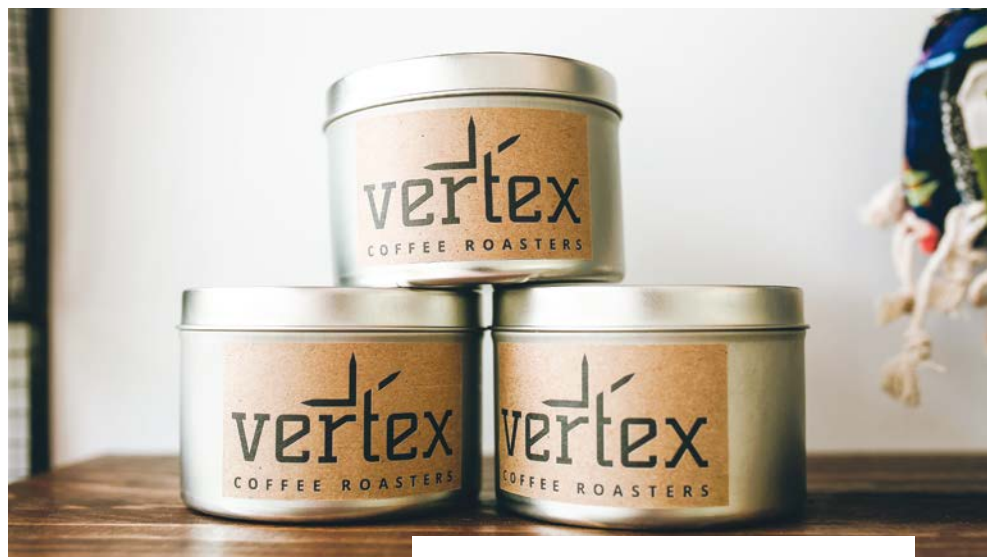
VERTEX offers beans in reusable to-go tins.